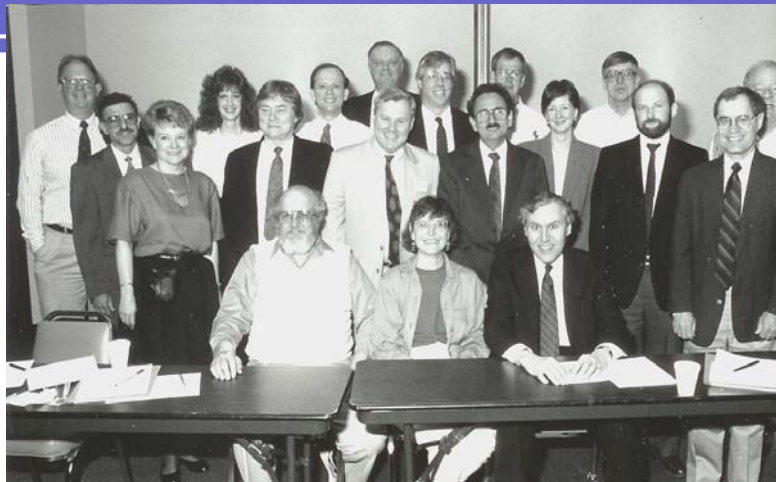
Spring 1991 University of Pittsburgh

21 st Annual National Prevention Network Prevention Research Conference August 26, 2008